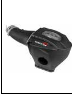
Momentum GT Intake