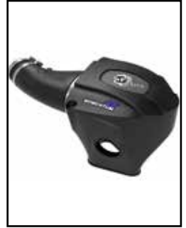
Momentum ST Intake