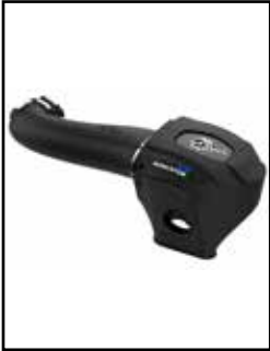
Momentum ST Intake