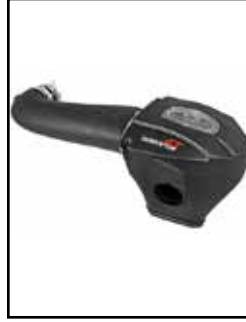
Momentum GT Intake