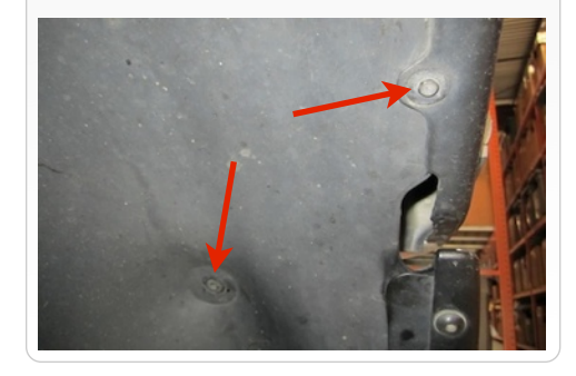
SEE EXPLODED VIEW ON PAGE 4

9. \ \, \text{Using a 8mm socket, remove the two} front screws outside the wheel liner.