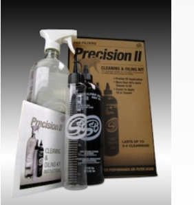
Order online today at www.sbfilters.com or through your local S&B distributor. Part #: 88-0008

11. Check to make sure the Scoop assembly does not interfere with the wheel or wheel well liner. Turn the wheel in both directions while trying to simulate full suspension travel. Make sure all connections are secure.